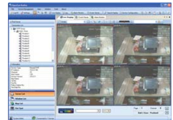
POS DATA OVERLAY